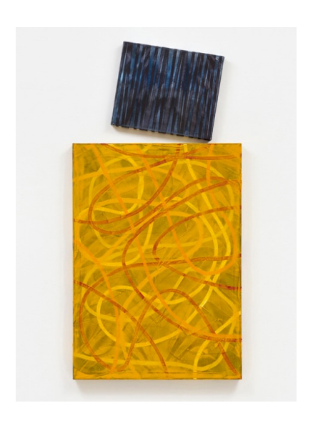
HELAU, 2015 Oil on canvas, 20" x 23 3/4" and 55" x 39 1/2"

In one painting titled Helau, the head of the diptych is tilted at a diagonal as if the pressure of painting's history is too much to bear and so the figure gives in with a quiet shrug. The title Helau translates as a greeting during the festivities of German Carnival and has associations with warning off evil spirits. In the case of Brormann's paintings, this coy tilt of the head throws off the expected rhythm of the exhibition and at the same time allows for any perceived weight to fall by the wayside.