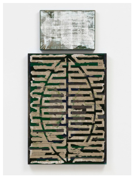
\it DICKICHT, 2015 Oil on Canvas, 20" x 23 3/4" and 55" x 39 1/2"

In one painting titled Helau, the head of the diptych is tilted at a diagonal as if the pressure of painting's history is too much to bear and so the figure gives in with a quiet shrug. The title Helau translates as a greeting during the festivities of German Carnival and has associations with warning off evil spirits. In the case of Brormann's paintings, this coy tilt of the head throws off the expected rhythm of the exhibition and at the same time allows for any perceived weight to fall by the wayside.