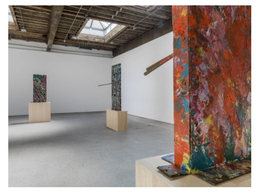
INSTALLATION: PAINTED SCULPTURE